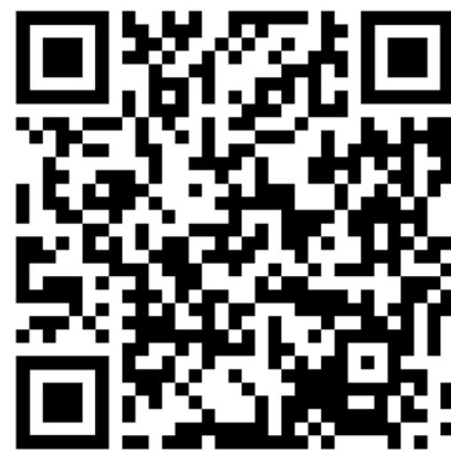
Taxiway U Opportunities