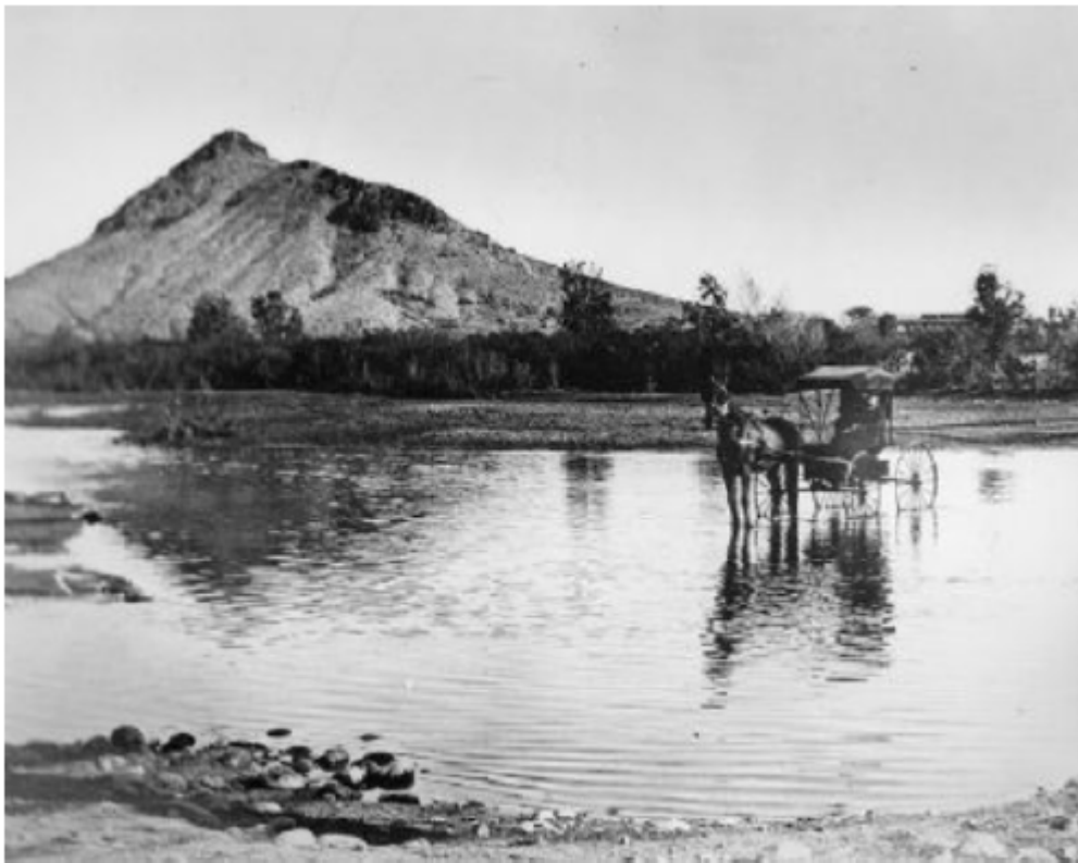
circa 1870

Stormwater from Phoenix Sky Harbor Airport drains into the Salt River, a historically and ecologically significant waterway. Fed by high-altitude springs, the river is part of an ancient irrigation system dating back to 600 A.D., which helped shape modern Phoenix. While the river mainly runs dry during the year, it still supports a vibrant desert ecosystem. Near its headwaters, bald eagles, southwestern river otters, and wild horses thrive along the Salt River corridor.